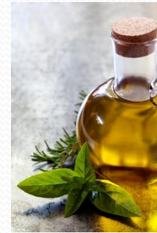
E.V Olive Oil